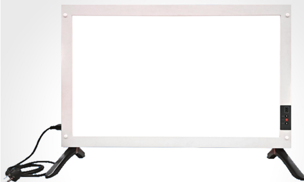
HF-GA-C2 LED medical viewing light